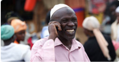
Figure 1 - Africa is among the fastest growing mobile telecom markets.

The mobile phone has emerged as an indispensable communications and computing machine in our fingertips. It has enabled the convergence of information technology and telecommunications systems, being a platform for a range of services from basic telephony to data services for people from around the world. Advances in consumer electronics and software technologies is bringing handsets that are increasingly usable, cheaper and full of features to consumers, allowing them to communicate, learn, socialize and do business in an increasingly connected world.